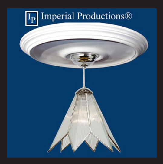
*Light Fixture Not Included

A Flexible synaptic polymer for vaulted or curved ceilings Interior & Exterior Use