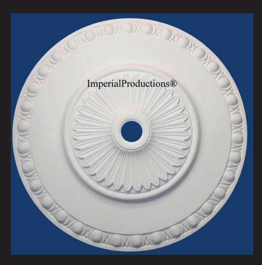
Canopy Area 3-1/4" (8.2cm)