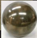
Leather - Nickel